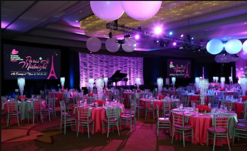
The Venue—Westin Mission Hills Resort & Spa was magically transformed.